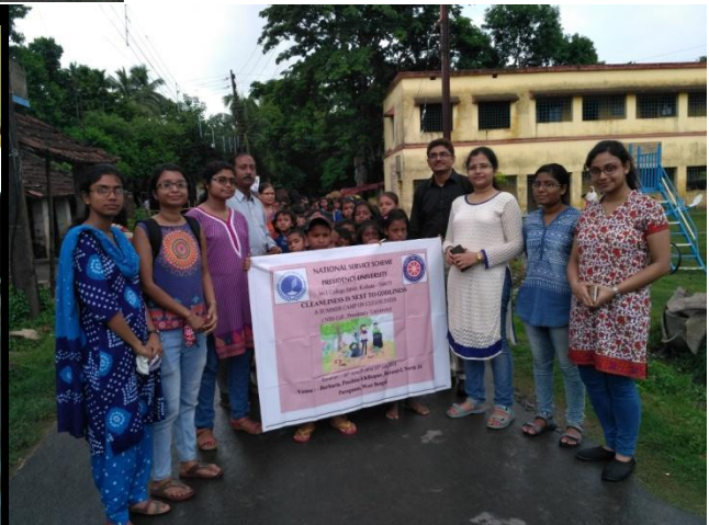
Swachh Bharat Summer Internships